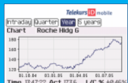
Chart display: up to max. 5 years