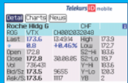
Real-time prices: easy and clear to call up