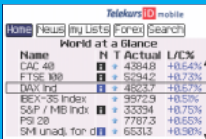
Market summaries: the major global markets

As a BlackBerry user with Telekurs iD mobile, you can keep up with events on the international financial markets wherever you are. The financial information system for mobile phones and PDAs (currently BlackBerry) offers easy access to current prices and descriptive data. The data are updated automatically. Business news and market summaries round out the mobile information offering. Functions such as instrument search, limit supervision or charts are part of the service. The simple, flexible and mobile management of personal user lists while you're on the move is a special highlight.