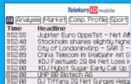
News: direct links to up-to-date quote lists